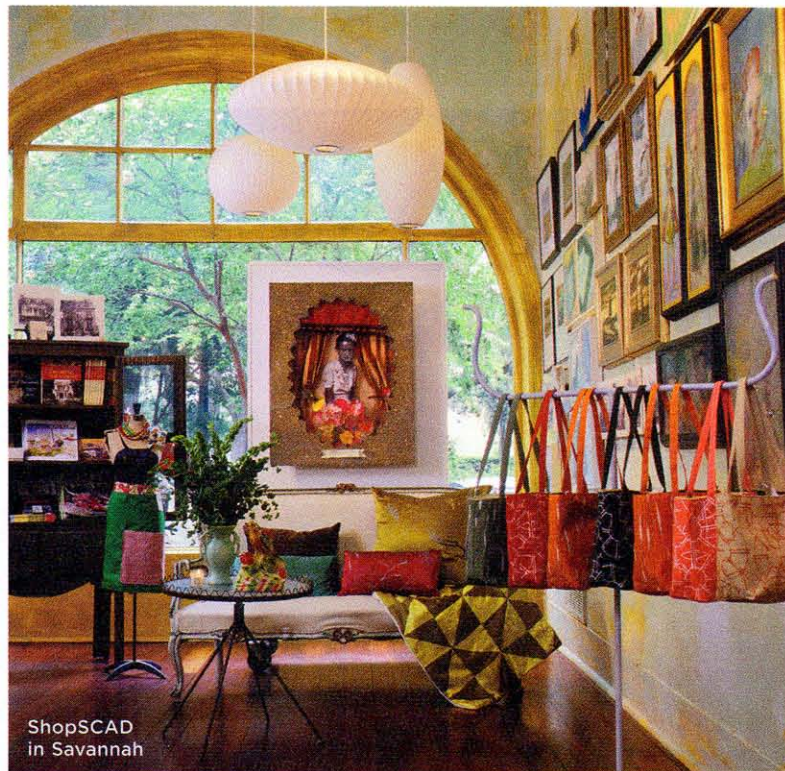
ShopSCAD in Savannah